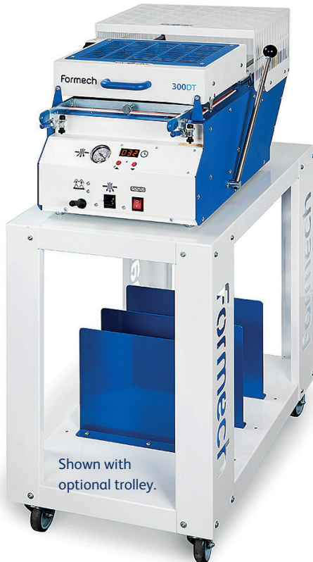
Shown with optional trolley.

with a quiet built in vacuum pump and moulding release. Easy to transport, move, and use, this 300DT is the perfect solution for creative hobbyists, artisans, and students.