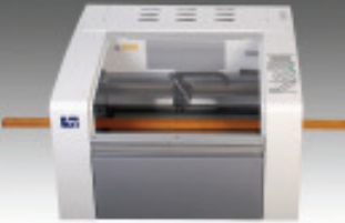
Both side opening for long material