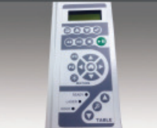
4 Line LCD panel