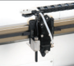
Pin Type Auto Focus