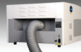
Rear side for Facility exhaust