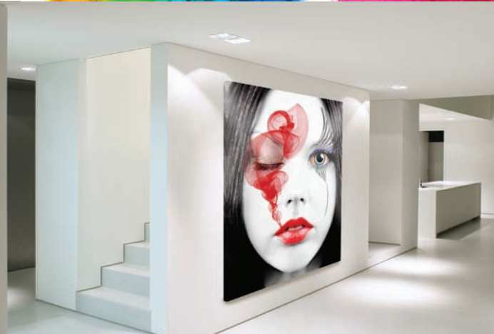
In-house decoration – dibond