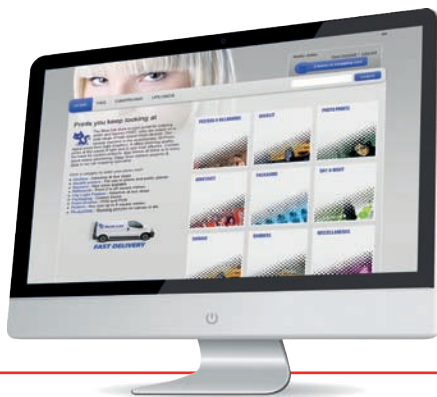
StoreFront web-to-print software