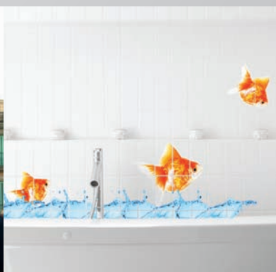
In-house decoration – tiles