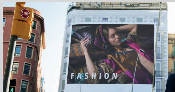
Outdoor communication – vinyl