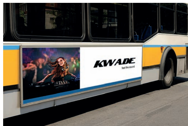
Outdoor communication – vinyl

As a highly-advanced printer powered by Asanti, the hybrid Anapurna LEDs integrate perfectly with PrintSphere, Agfa Graphics' cloud-based service for production automation, easy file sharing and safe data storage. This integrable cloud service offers a standardized way for print service providers to automate their workflows and facilitate data exchange with customers, colleagues, freelancers, other departments and other Agfa solutions.