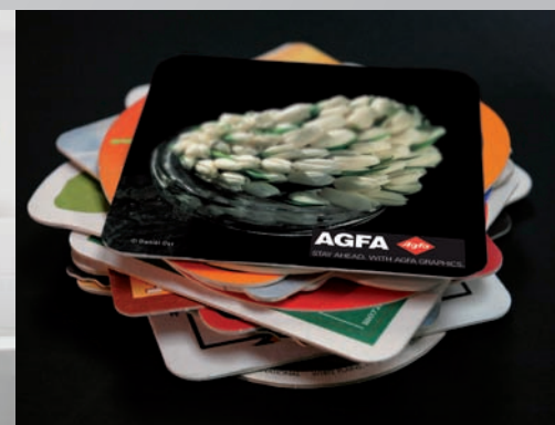
Object printing – cardboard