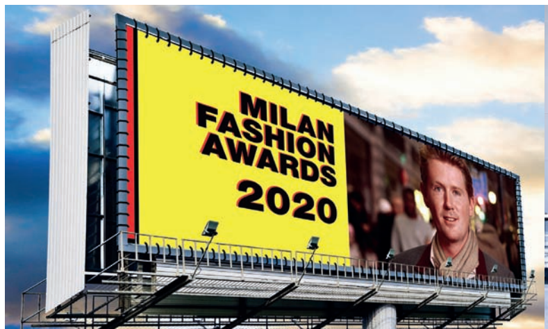
Outdoor communication – vinyl