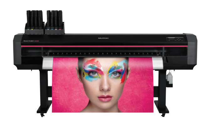
XpertJet 1682SR 1625 mm - 64" / Dual Head / 2 x 4 or 7 Colours