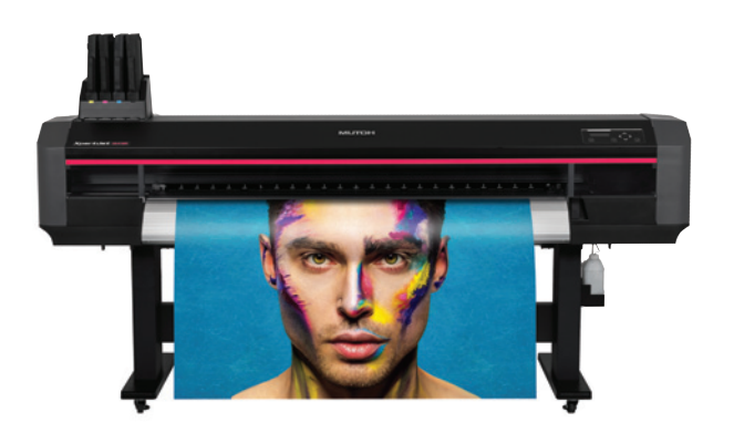
XpertJet 1641SR 1625 mm - 64" / Single Head / 4 Colours