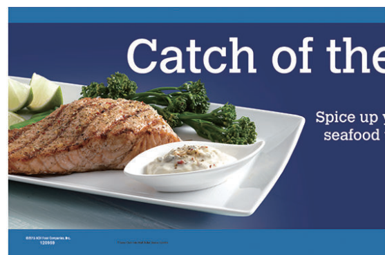
Image Dimension: 569 x 373 mm Image Pixel: 13440 x 8808 Resolution: 600 x 600 dpi